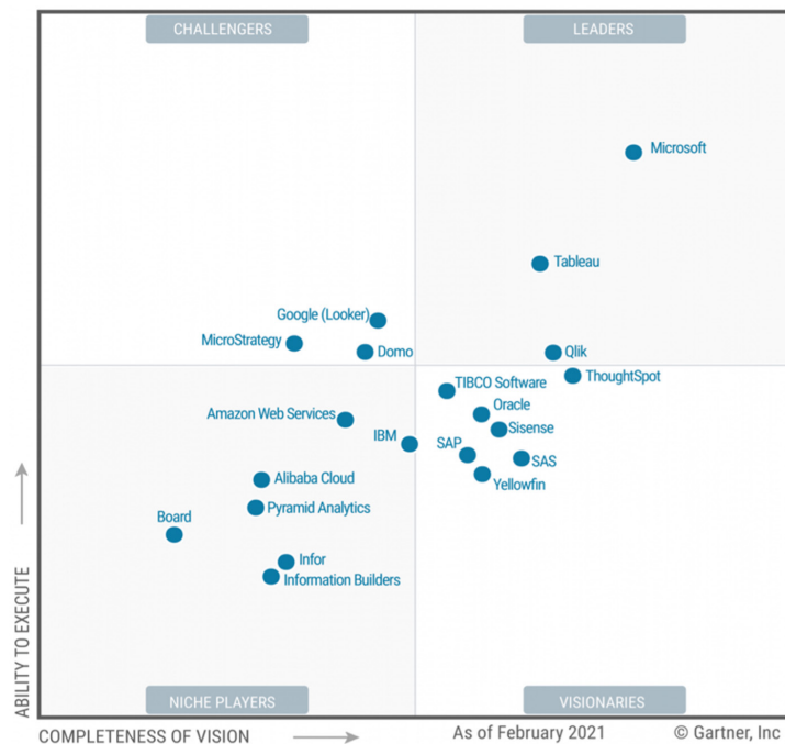
Gartner (February 2021) Magic Quadrant for Analytics and Business Intelligence Platforms

Data intelligence growth propelled by ThoughtSpot is inevitable. Experts in this space have witnessed the evolution of data storage and advanced analytics from enterprise data warehousing to lake houses. Coupled with a shift in data ownership being decentralized in a global data mesh.